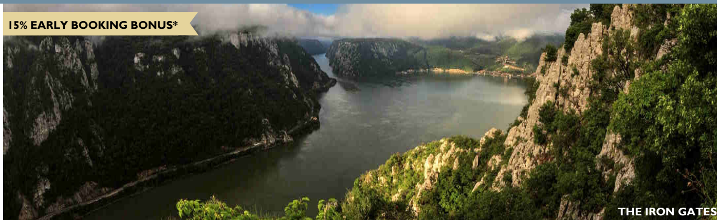
THE IRON GATES