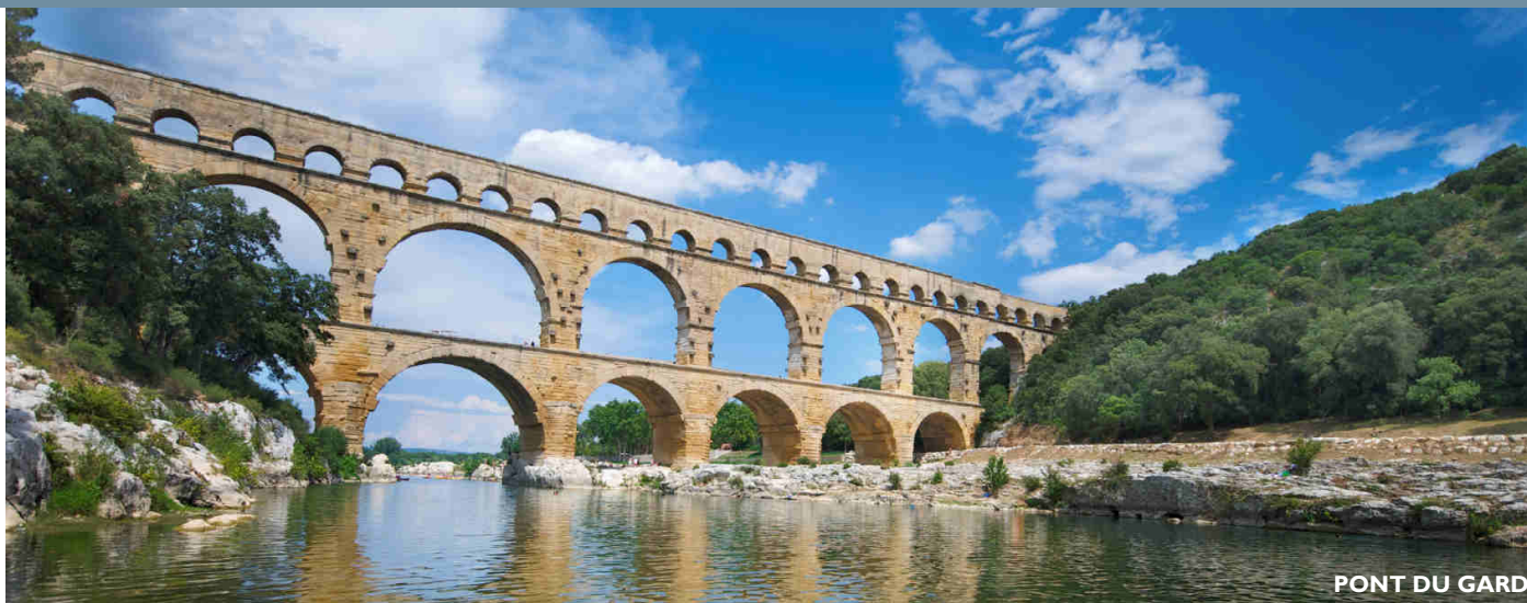
PONT DU GARD